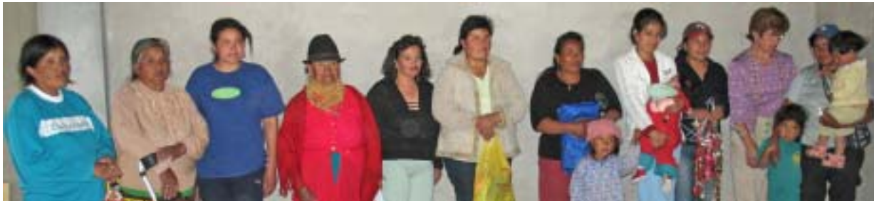
The Sister to Sister program was organized to train and enable women to develop a cooperative to make and sale jewelry which is providing basic sustenance to their village in Quito Ecuador.