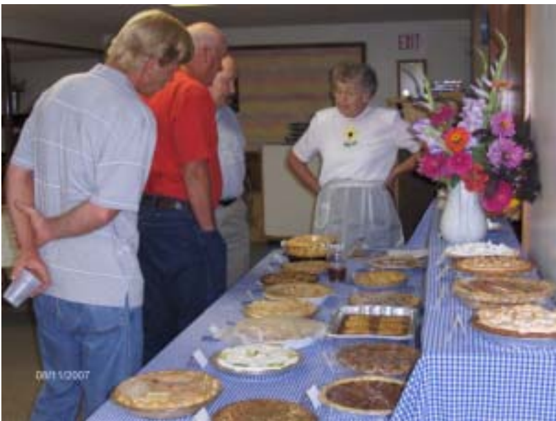
Many beautiful and tasty pies were donated for the pie auction.