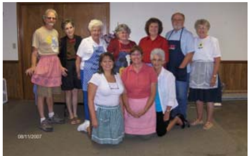
The women and men who helped organize the pie supper show off their aprons worn at the event.

Also, we are asking everyone to bring an object that symbolizes what we do so that it can be placed up front as a way to honor our offerings to build a constructive world together.