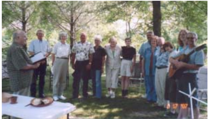
The congregation celebrated worship outdoors on July 17 with a beautiful day, a fun crowd, and a warm Spirit.