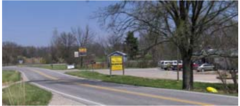
MCC volunteers picked up 16 bags of trash along their assigned portion of S.R. J. Three of those bags are visible here near the entrance to Lake Breeze.