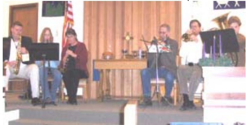
The MCC Band presented a rousing prelude of Christmas carols to begin worship on Christmas Eve day.

Sign up for a committee. Enjoy the work of the church. Be a part of the decisions. Help set our direction.