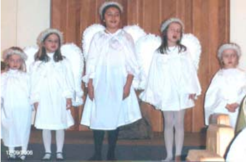
The little angels of the congregation sang a special number during the Christmas pageant held December 9.

What are you doing to start the new year off on the right foot? What are you going to do for the church this next year?