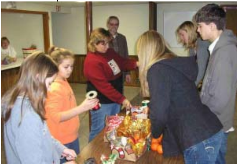
The youth of the congregation came early on the day they went Christmas caroling to help prepare a basket of cookies and fruit for those who were shut-in or ill in the Millersburg area.